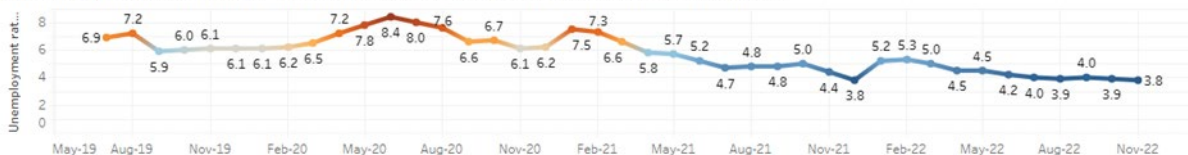
SA Unemployment Rate by month - since July 2019 (source: ABS Labour Force Survey, not-seasonally adjusted)

Source: https://www.abs.gov.au/statistics/labour/employment-and-unemployment/labour-force-australia-detailed/latest-release