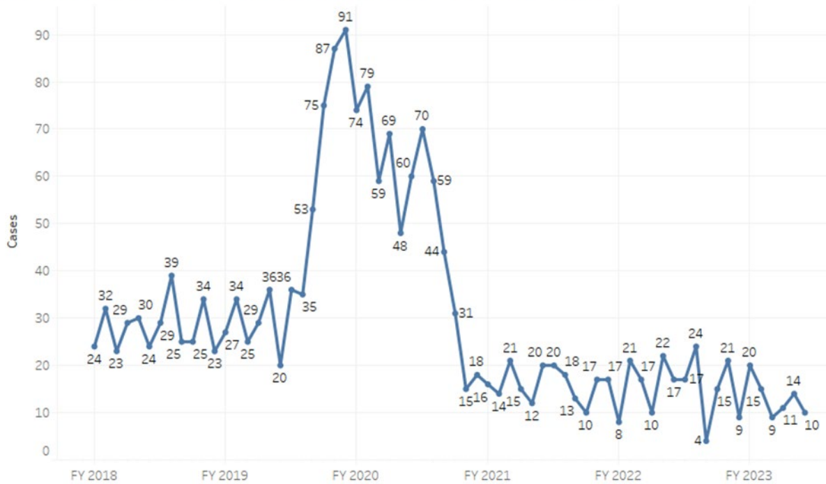
Cases with Issue of Payment Difficulties - Received each month since July 2017

Prior to January 2019, on average Energy & Water Ombudsman SA received just under 30 cases related to Payment Difficulties per month. From January 2019 onwards, there was a two-year period of elevated cases of this type, peaking in the middle of 2019, which was often linked to disconnections due to non-payment. Coinciding with the COVID-19 pandemic restrictions in Australia, and the Australian Energy Regulator (AER) enforcing restrictions on disconnections, the number of these cases reduced significantly from May 2022 onwards.